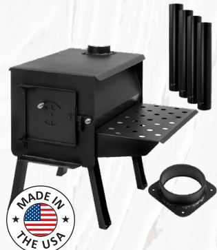
ENGLAND'S GRIZZLY CAMP STOVE KIT #12-CSLKIT. SKU #60640025 8 hr burn time. Heats to 800°