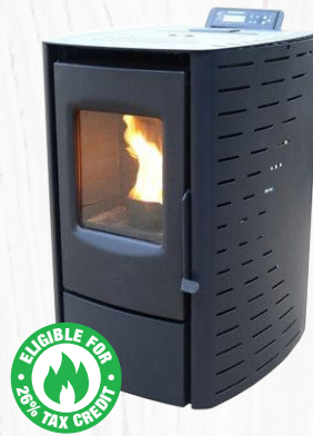
CLEVELAND IRON WORKS SMALL PELLET STOVE #F500215. SKU #36640068 BTU: 25K. Heats 800 sq. ft.

Some products may not appear online or in store, but are still available for special order. All sales are subject to product availability which can change often. Contact an L&M associate to place your special order today 1-866-826-4548 or support@landmsupply.com