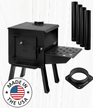
ENGLAND'S BLACK BEAR CAMP STOVE KIT #12-CSMKIT. SKU #60640023 14" Logs. Heats 14x16 tent