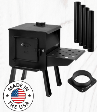
ENGLAND'S CUB CAMP STOVE KIT #12-CSSKIT. SKU #60640024 14" Logs. Heats 12x14 tent