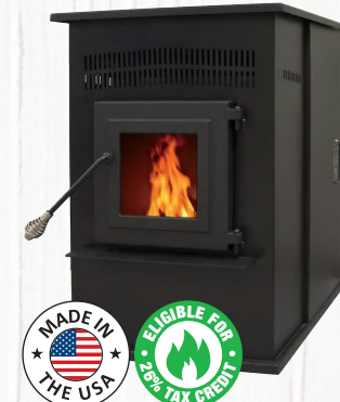
ENGLAND'S SUMMERS HEAT PELLET STOVE #55-SHPCBPAH. SKU #60640030 BTU: 24K. Heats 2200 sq. ft.