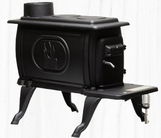
US STOVE CO LOG WOOD STOVE #1269E. SKU #2900216 BTU: 54K. Heats: 900 sq. ft.