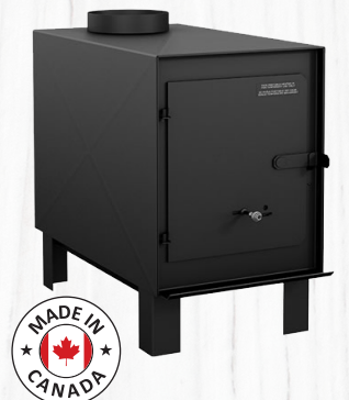
DROLET HUNTER WOOD STOVE #DB00400. SKU #39860001 20" Logs. Heats 1000 sq. ft.

Some products may not appear online or in store, but are still available for special order. All sales are subject to product availability which can change often. Contact an L&M associate to place your special order today 1-866-826-4548 or support@landmsupply.com