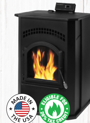
ENGLAND'S SMART STOVE PELLET STOVE #55-SHPCB120. SKU #60640007 BTU: 45K. Heats 2200 sq. ft.