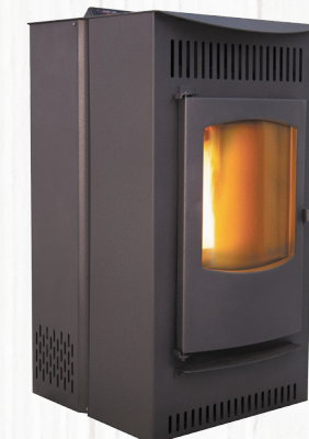
CASTLE SERENITY PELLET STOVE #12327. SKU #15080307 BTU: 32K. Heats 1500 sq. ft.