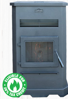
CLEVELAND IRON WORKS LARGE PELLET STOVE #F500205. SKU #36640067 BTU: 49K. Heats 1800 sq. ft.